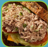
3. Canned/ Pouched Tuna